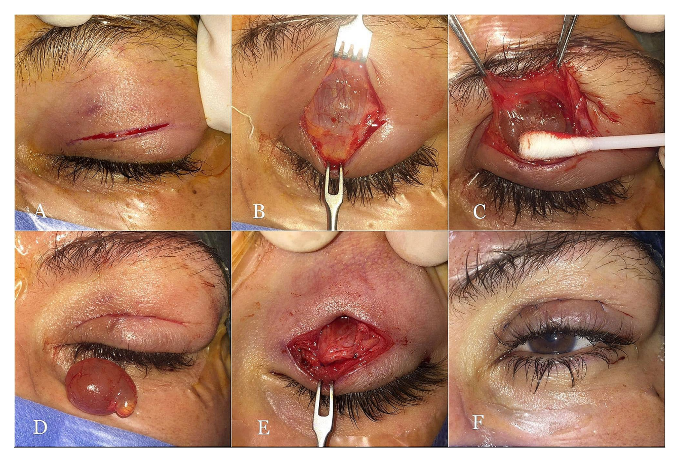
Fig. 1 Transcutaneous approach for upper eyelid Wolfring gland ductal cysts. (A) Medial eyelid crease incision. (B) The cyst appears beneath the levator aponeurosis after opening the orbital septum and retracting the preaoneurotic fat. (C) The levator Muller complex is dissected from the anterior surface of the cyst with the aid of a cotton swab. (D) The cyst is completely excised with an intact wall. (E) The levator aponeurosis is reattached to the tarsal plate. (F) After skin closure

Lower eyelid (supplementary fig. S1A-F) Through an infraciliary incision, the orbicularis muscle was transected while preserving the pretarsal segment. The lower eyelid retractor was then detached from the inferior tarsal border to expose the anterior surface of the cyst. Gentle dissection was performed to separate the cyst from the surrounding tissues with the aid of cotton swabs until the area of tarsal attachment, where sharp dissection was needed.