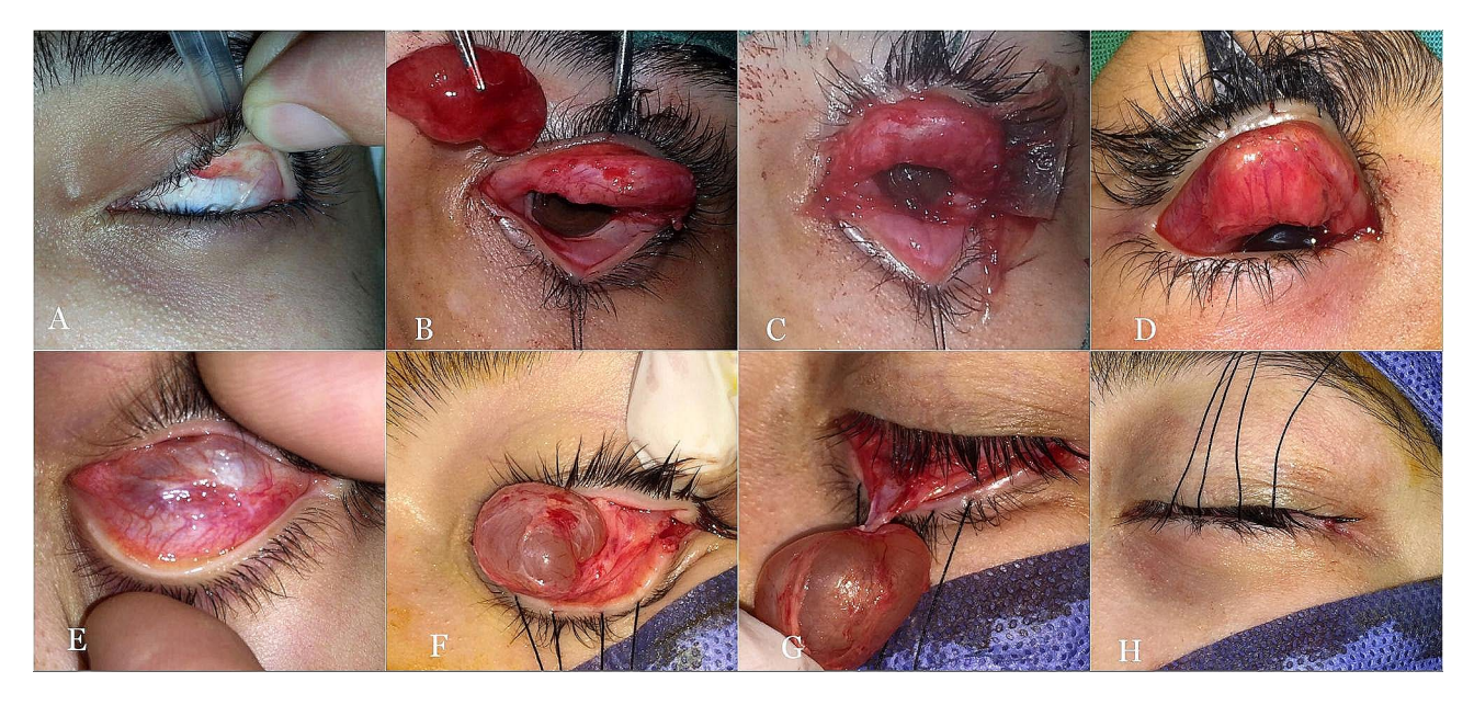
Fig. 2 Transconjunctival approach for upper and lower Wolfring gland ductal cysts. (A) The upper eyelid is everted with difficulty due to conjunctival scarring. (B) A large cyst with an intact wall was removed, leaving a large conjunctival defect. (C) An amniotic membrane graft was used to cover the defect. (D) A conjunctival autograft is sutured in place in another patient. E A cyst is visible through the conjunctiva of an everted lower eyelid. (F, G) The cyst is dissected from the surrounding tissues away from the area of fibrotic adhesions first. H At the end of the surgery

tenderness to touch. The mean duration of symptom(s) was 16.4 months (median 11.5 months; range 4–56). Most (45/48) patients had an insidious course; however, 3 patients experienced rapid growth over a few days with subsequent complete ptosis.